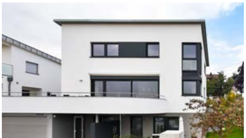
Image on right: Nürtingen clinics, DE Design: HSP Hoppe Sommer Planungs GmbH, Stuttgart, DE Execution: Anton Geiselhart GmbH & Co. KG, Pfullingen, DE Sto expertise: StoColor Sil In, StoColor Climasan

Image below: Detached house, Vaihingen, DE Design: Stecher architecture firm, Vaihingen, DE Execution: Hettich GmbH, Vaihingen, DE Sto expertise: StoColor Dryonic®, StoColor Supermatt